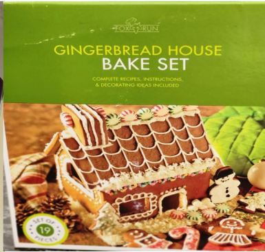
2 gingerbread house metal baking kits complete with recipes and instructions to create your masterpiece displays each year. $15 each