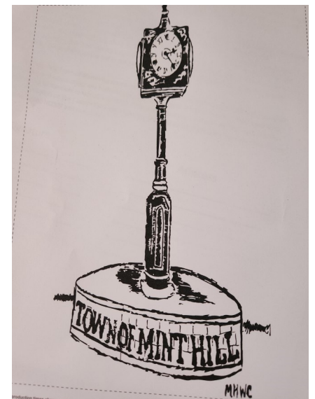
Image of the town clock on a 16"x24" keepsake Tea Towel. Image will be black on white towel. Image is 11" by 6" for easy display. These towels are not sold anywhere other than thru MHWC. $15 each or 2 for $25. Great for hostess gifts.

We are working with a few other vendors to provide items for the POP UP Shop. These items including all the candy, cookies, breads and cakes will not be available at the Nov Meeting.