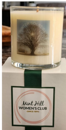
Custom Ella B's soy candle in mistletoe / spearmint scent. Limited supply available $30 each