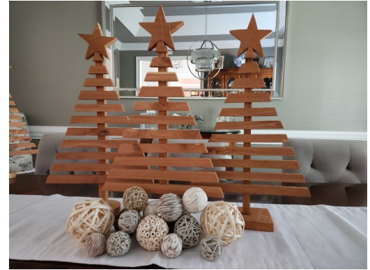
22" cedar slat Christmas trees for sale $30 each