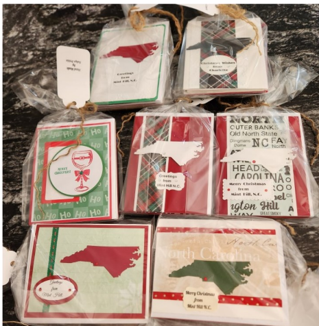
Assorted handmade greeting cards. Either set of 6 assorted Christmas cards or assorted variety of other greeting cards. We will have 2 member artisans items available. Set includes 6 cards for $20