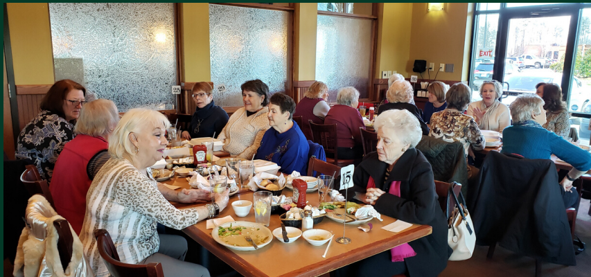
Feb Lunch Bunch at Jimmies

25 ladies enjoyed lunch this month at Jimmies Restaurant. A wide variety of membership years were present including a couple of our founding members. It was such a nice treat to see such a large crowd attend and enjoy fellowship and conversation. It was one of the largest gatherings of our Lunch Bunches!