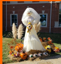
Last Year's Display

Members Pictures for Directory—see page 4